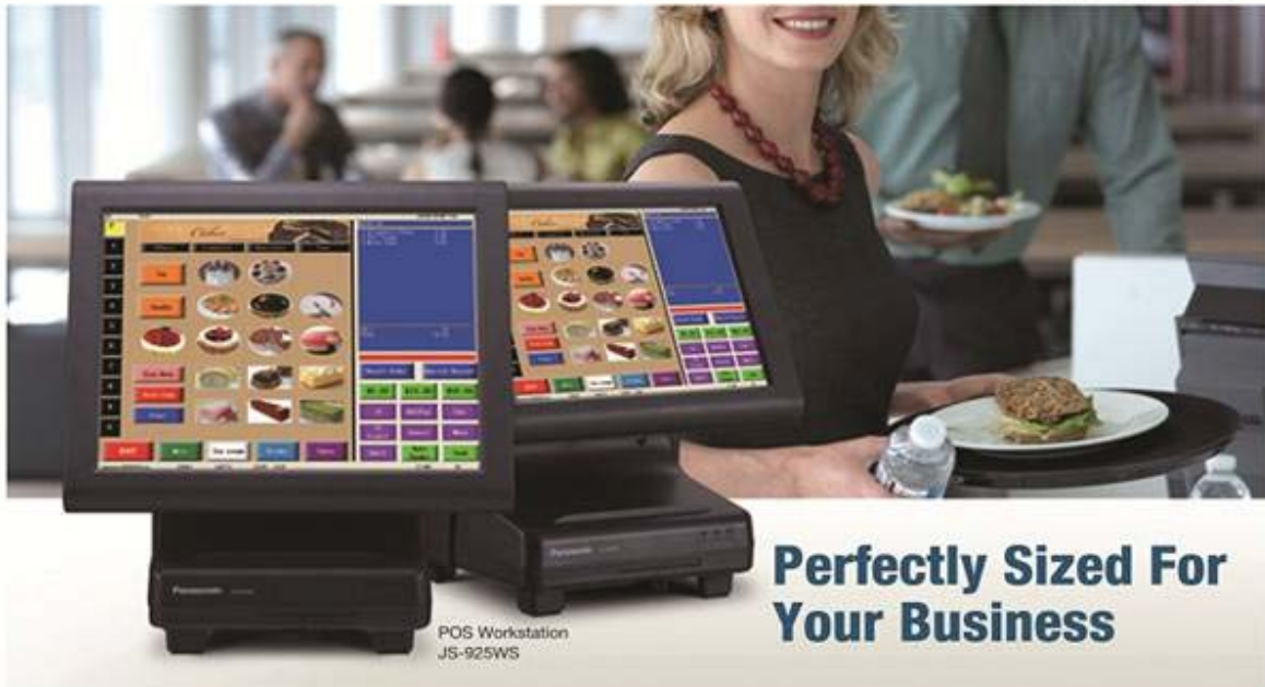
POS Workstation JS-925WS